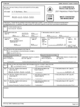
Produces Report Forms GM and OI, in addition to the Site ID Form. Prints manifests and waste labels.

The WASTE module saves time, by making efficient use of information contained in the program: